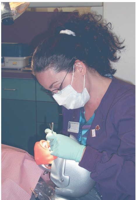
Figure 2 —The “hygiene hunch.” Without loupes, the clinician must lean over and into the patient, causing significant strain on the back, neck, and shoulders. The clinician's arms cannot be lowered to a comfortable parallel position.

Some manufacturers make 2.5x magnification loupes that let you visualize the entire mouth at one time.